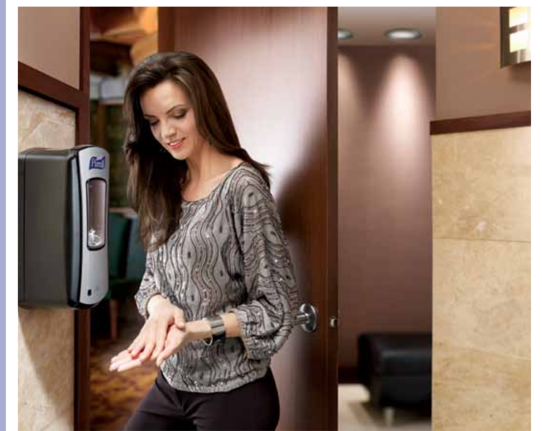
PURELL® PERFECT PLACEMENT at restroom exits.

Spotlight the value you place on GUEST and STAFF well-being.