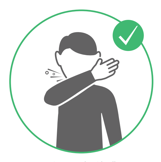
covering mouth with elbow

REMEMBER! Always wash your hands after you cough, sneeze, or blow your nose so you don't spread germs!