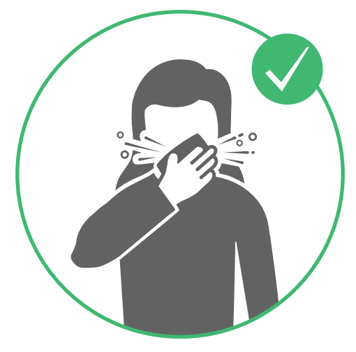
covering mouth with tissue