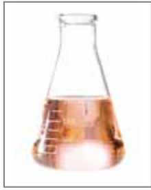
Figure 1: Low-Volume Contamination Procedure

Grow S. marcescens at 35°C with vigorous shaking (~10 10 CFU/ml)