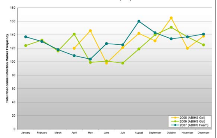
Figure 1: Hospital NIM rates ranged from 3.58% to 5.92% for the 21-month gel IHS phase (April 2005 - December 2006) and from 4.09% to 5.99% for the 1 year foam ABIHS implementation phase (January 2007-December 2007). Analysis of overall NIM rates revealed no significant difference between the gel ABIHS phase and the foam ABIHS phase ($\rho$>0.889). Therefore, PURELL* Instant Hand Sanitizer gel and PURELL Instant Hand Sanitizer Foam provide the same level of nosocomial infection control and prevention.

Nosocomial Infection Marker Frequency: 2005 - 2007