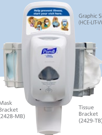
Mask Bracket (2428-MB)