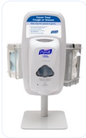
PURELL Table Top Stand (2426-DS) shown with Mask Bracket (2428-MB), Tissue Bracket (2429-TB), PURELL TFX Touch Free Dispenser (2720-12), and Instructional Sign (HCE-LIT-VWCS2)